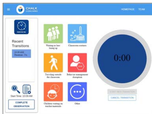
Figure 1. Collect Data

The observation tools we are creating based on each of the eight practices (above) are designed to be simple and intuitive for the user. The goal is that the tool will guide the coach to collect objective behavioral data . Each button/behavior indicator is chosen because it represents a practice that a coach and teacher can directly focus on in their work together.