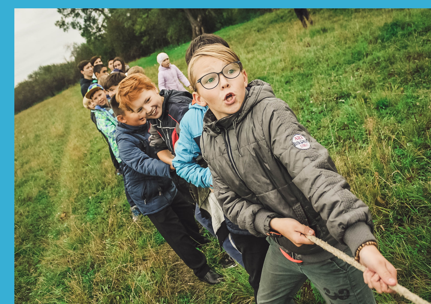
Rural Middle Schools